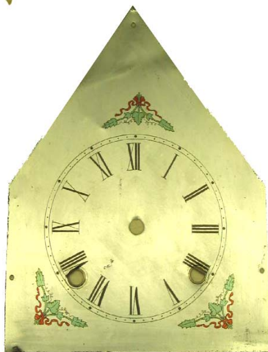
Dial