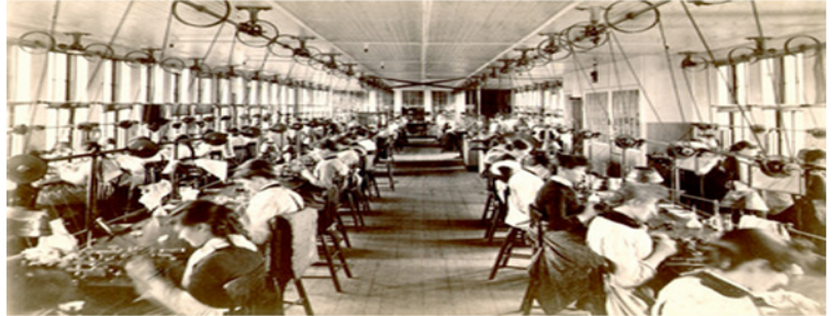
Waltham Watch Company