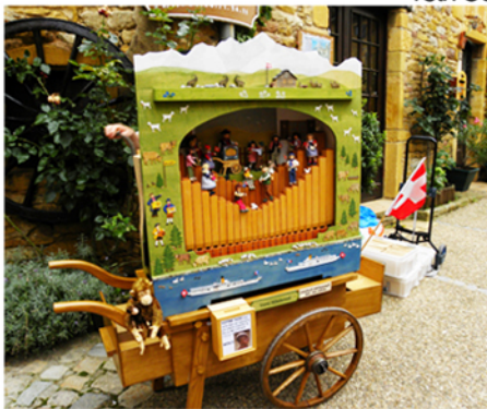
Oingt Festival Mechanical Organ