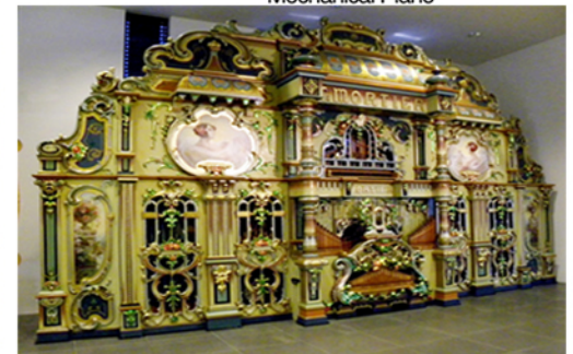
Seewen Museum Mechanical Organ