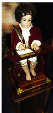
Jacquet Droz 1770's Android, The Writer Mechanism