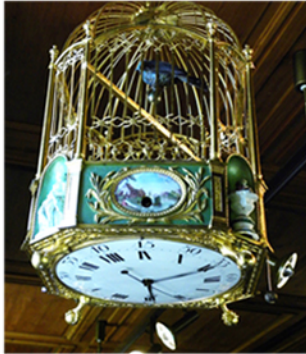
Le Locle Museum The Bird Cage