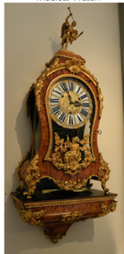
Oberhofen Museum 18th Century Clock