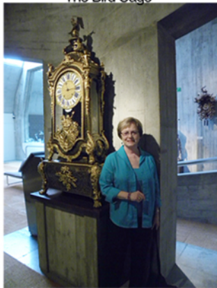
La Chaux de Fonds Museum