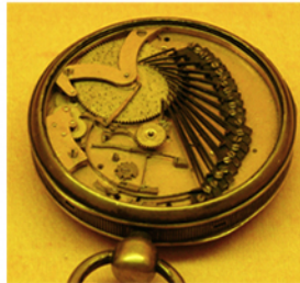
Baud Museum Musical Watch