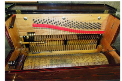
CIMA Museum Mechanical Piano