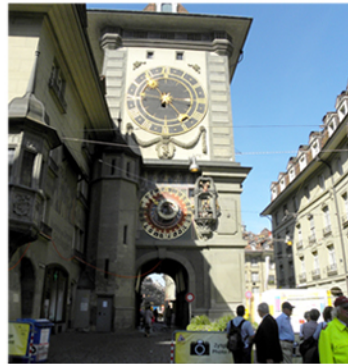
Zytgogge Clock Bern