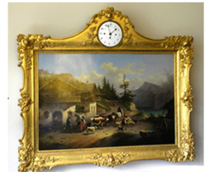
Christian Bailly Studio Picture Clock