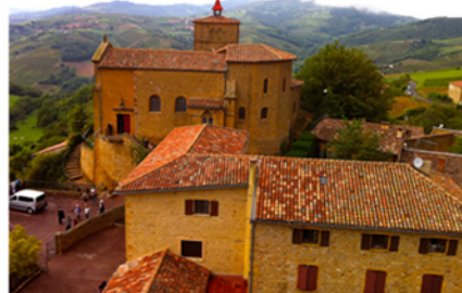
Oingt Festival in the Medieval City of Oingt, France