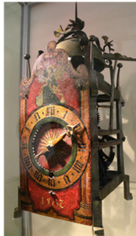
Oberhofen Museum Clock from 1587