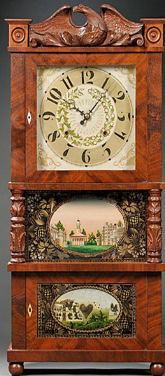
Joseph Ives Triple Decker Shelf Clock c.1832

President's Message 2017 National Convention Chapter Events