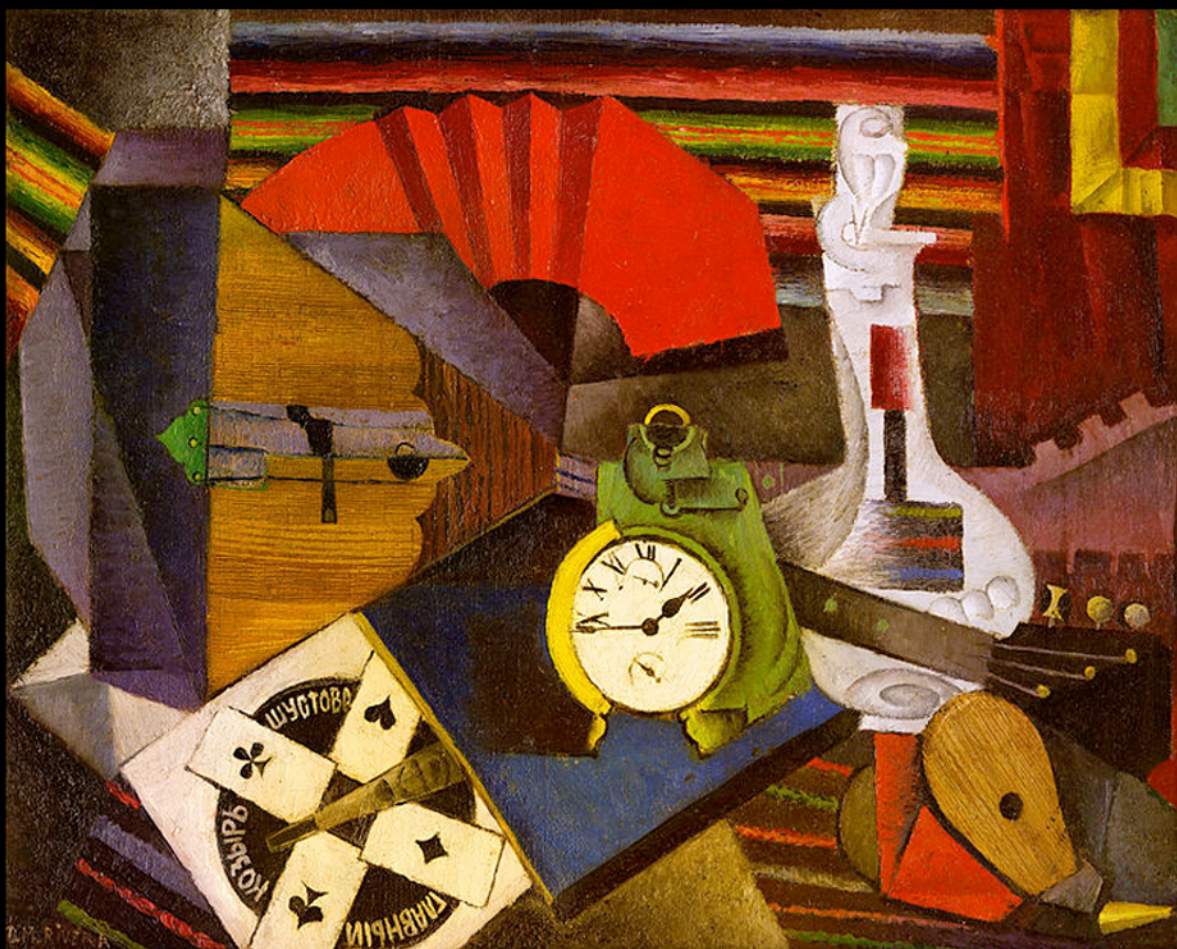
The Alarm Clock-Diego Rivera-1914