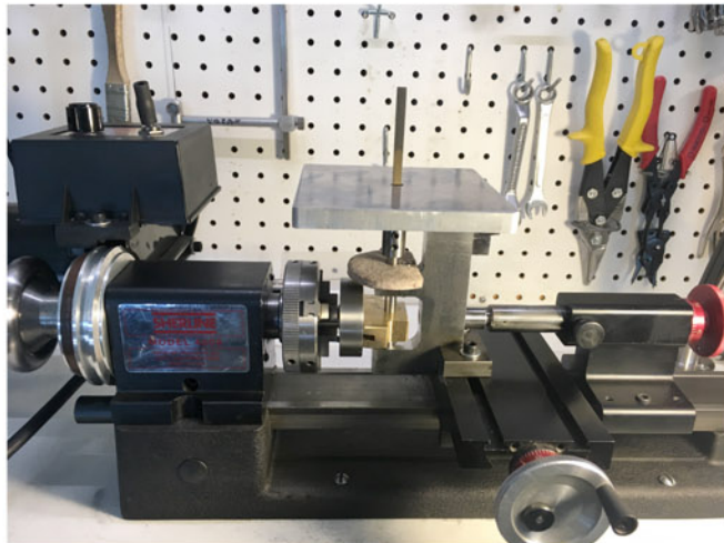
Filer Mounted on the Sherline Lathe