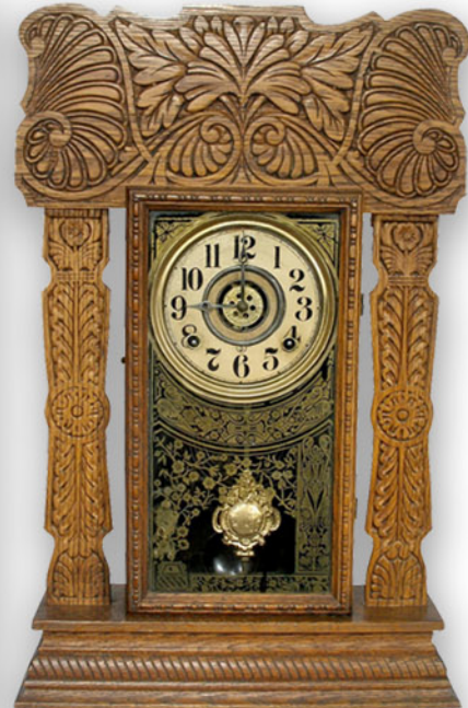
Ingraham c1890 8 Day Rooster Alarm Clock