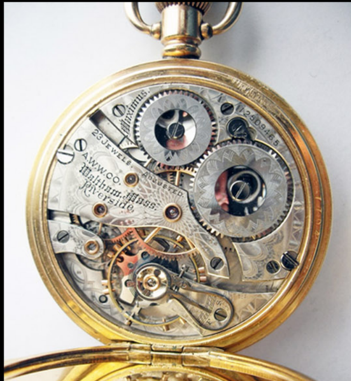
Waltham Riverside Maximus c 1903