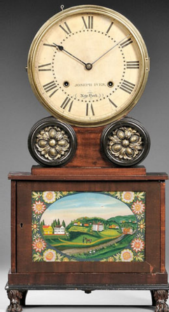
Joseph Ives "Brooklyn" Shelf Clock

FEBRUARY 2017 VOLUME 34-4 MEMBERSHIP 460