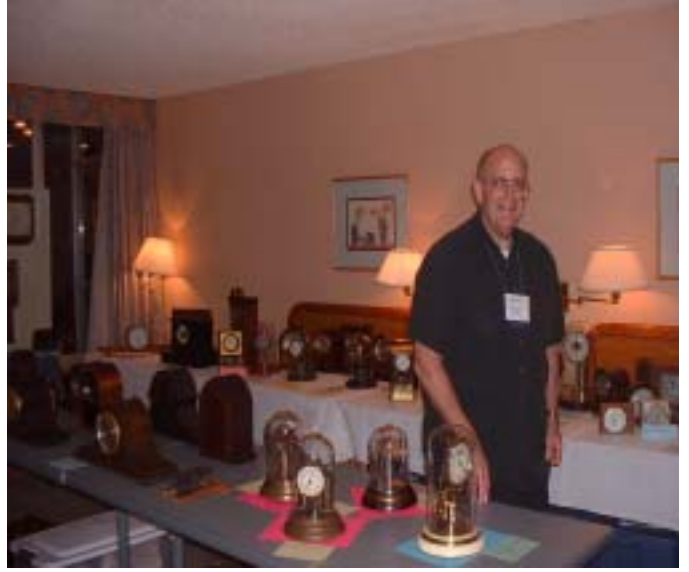
Electromechanical Clocks - Rodney King