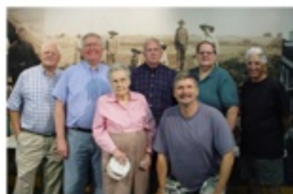
Self Winding Clock Class