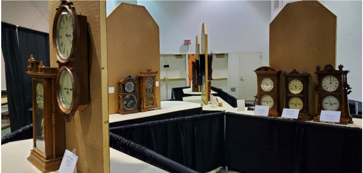
2024 Regional Exhibit